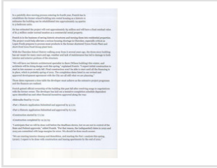
Wilson School rehab2