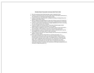
Cherokee Historic Preservation Commission Work Plan for 2021.docx

Please upload the upcoming year's work plan here.