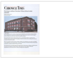
Wilson School rehab1