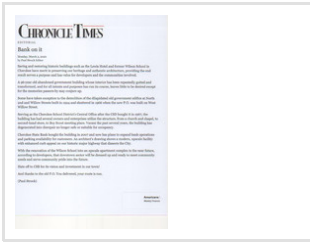
Wilson School rehab3