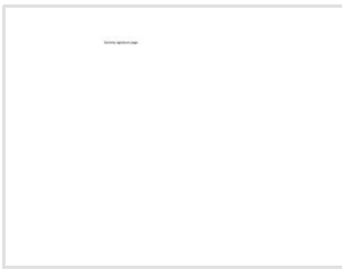
Dummy signature page.docx