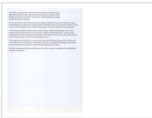
Wilson School rehab5