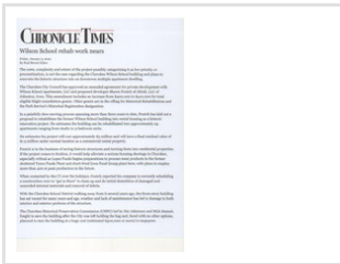
Wilson School rehab4